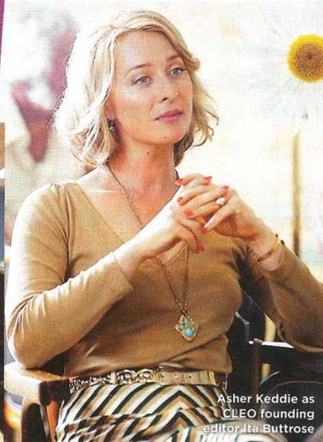
Asher Keddie as CLEO founding editor Ita Buttrose